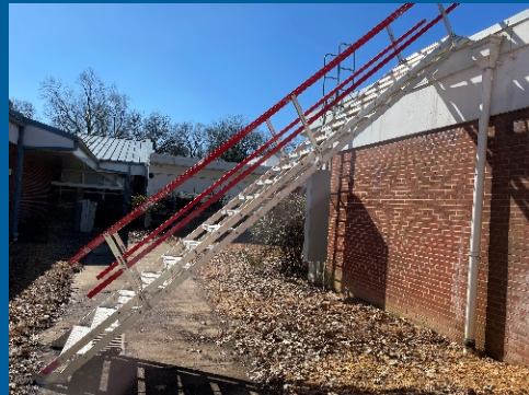
Installment of Adjustastair for roof access