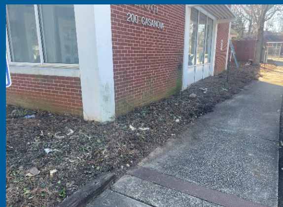
Shrubs demolished at front entry