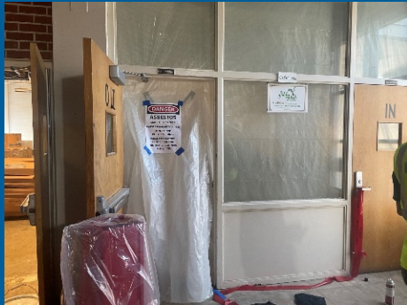
Exclusion Zone for abatement work