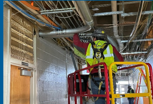
Rough-in for main electrical lines in Area D