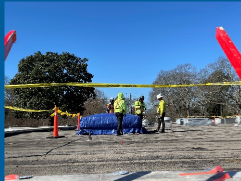
Loading and Installing warning lines @ Area D Roof