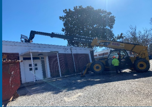
Loading roofing material onto roof @ Area D